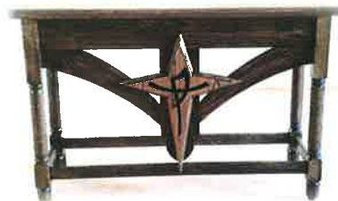
Special thanks to Joe Sieve for building the beautiful altar!